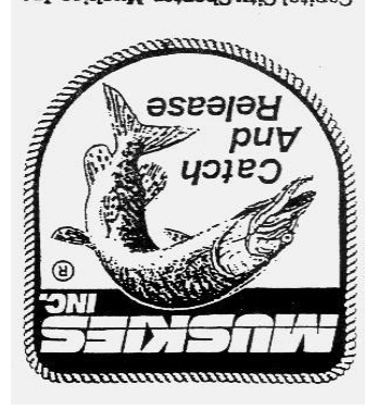
Capital City Chapter, Muskies, Inc. P.O. Box 8862 Madison, Wisconsin 53708